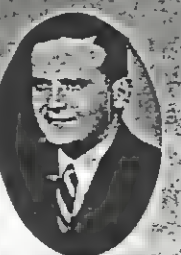
W. S. Roe Coal Mining